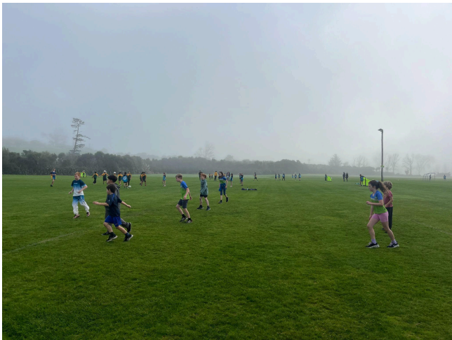
Tomarata School @ Rodney Rural Schools Soccer/Hockey Day on Tuesday.