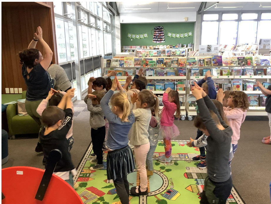
Room 1's Wellsford Library trip was an awesome success. Thanks to our parent helpers.