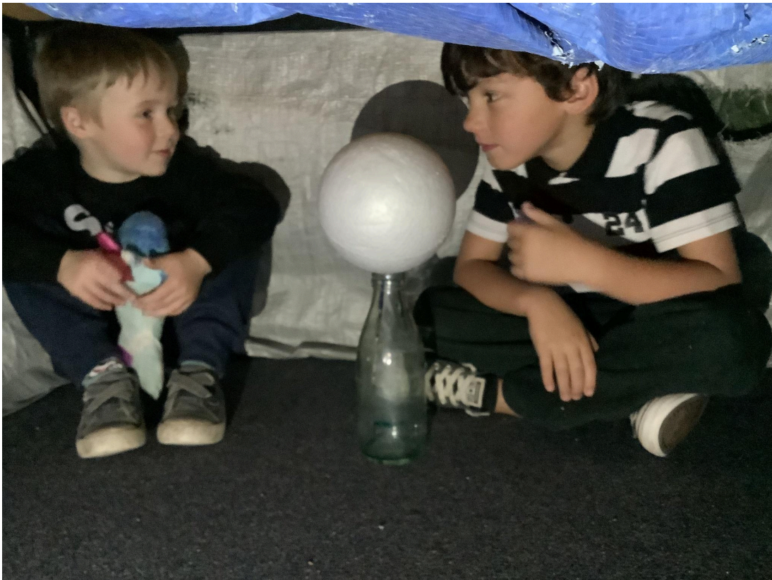
Room 1 students learning about the phases of the moon.