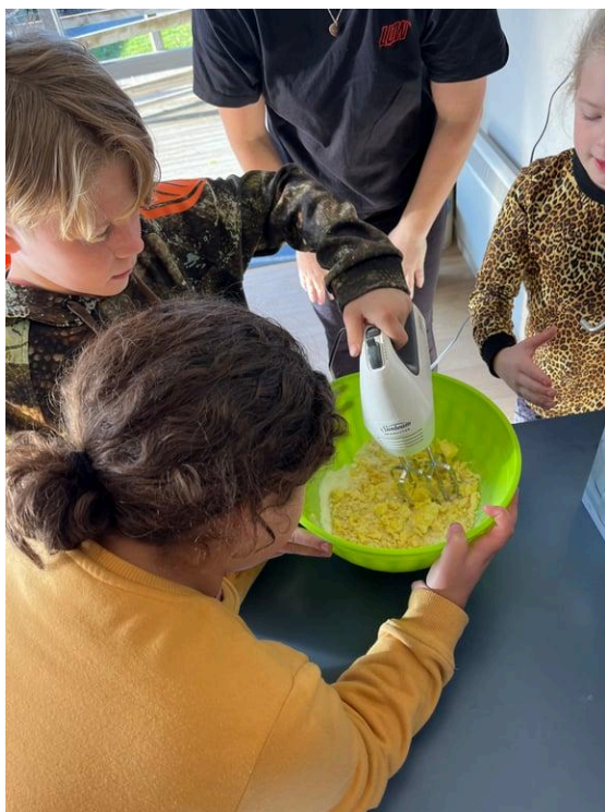
Room 5 Garden 2 Table last week.