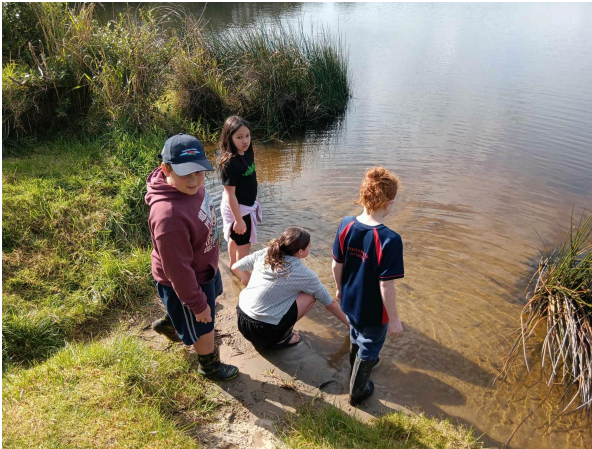
Four students from Room 7 took part in the pest fish eradication programme at Tomarata Lake. What an awesome experience.