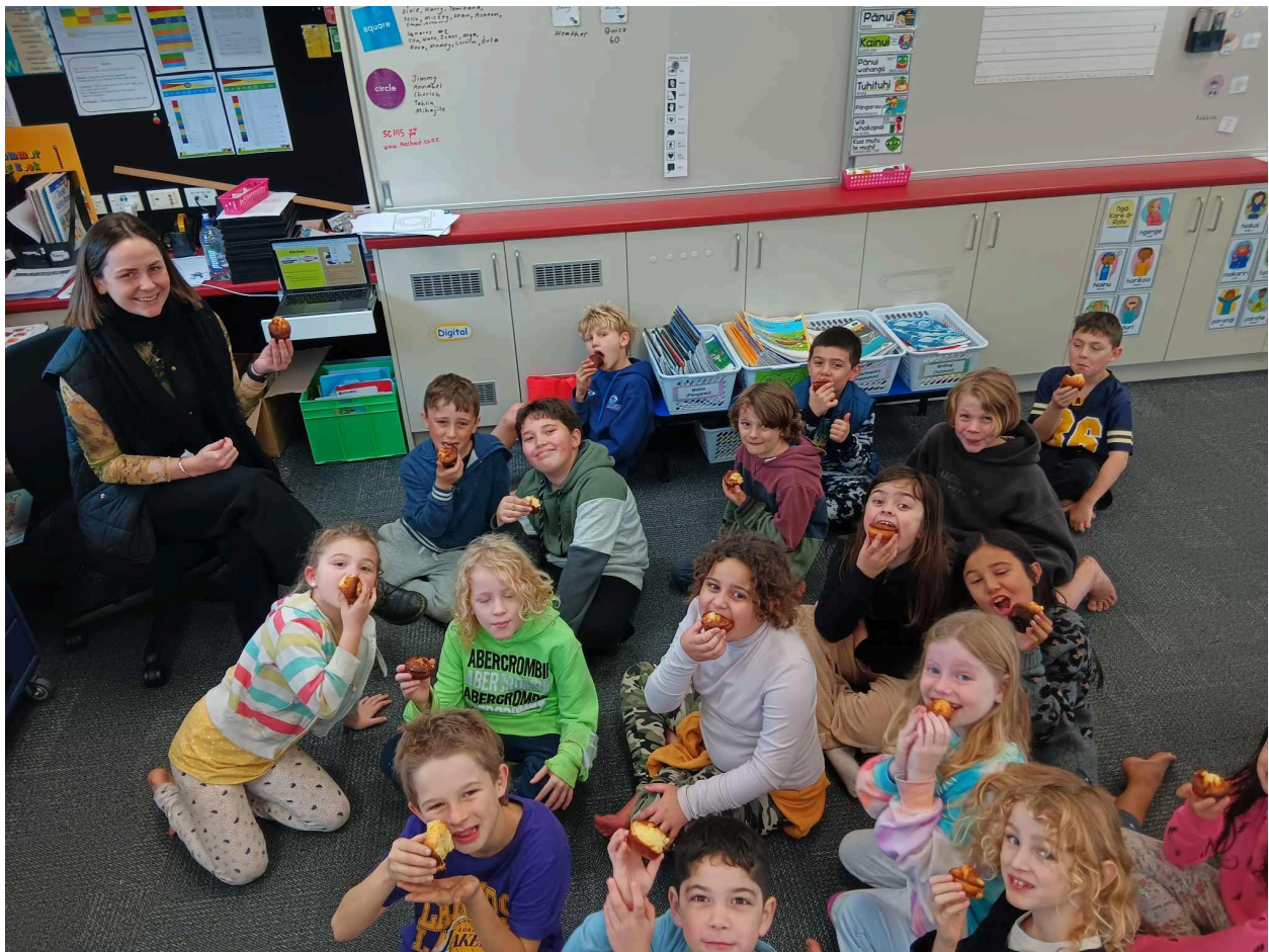
Garden 2 Table: Room 5 enjoying the fruits of their labours... Lemon muffins