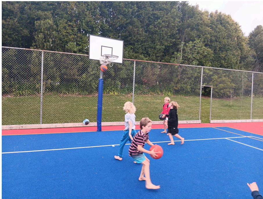
It's great to see our students playing and working on their sports skills at lunchtime.