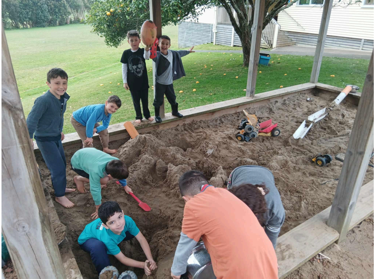
Friendship, camaraderie and creativity in the sandpit.