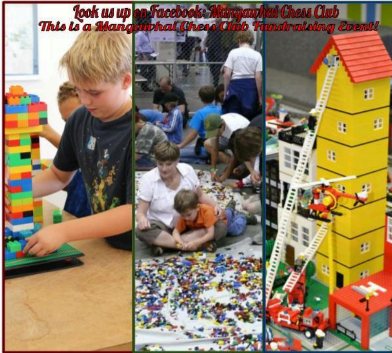
Look us up on Facebook: Mangawhai Chess Club This is a Mangawhai Chess Club Fundraising Event!