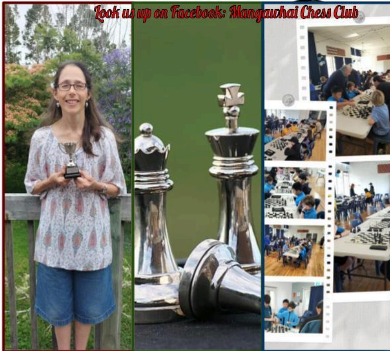
Look us up on Facebook: Mangawhai Chess Club