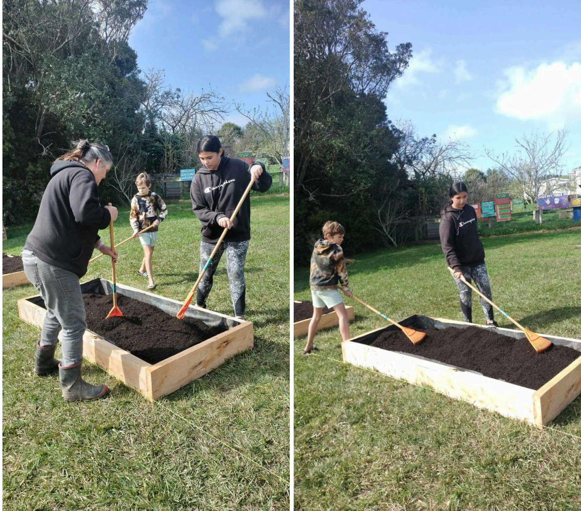
Room 7 working on our new garden beds.